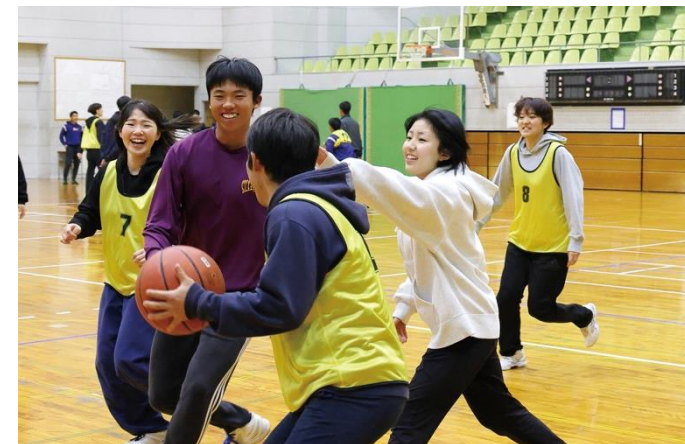
Contributing to people's health Health Management Course