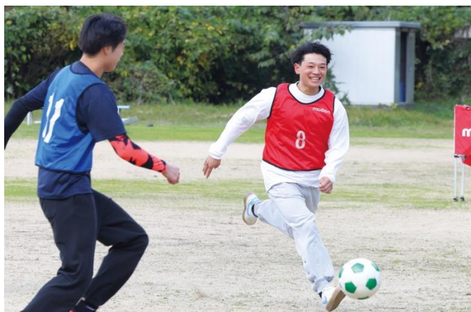
Communicating the wonders of sports Sports Education and Coaching Course

*3 This can be obtained by taking and passing an external training course for beginner parasports instructors hosted by Yamaguchi Prefecture or Shimonoseki City.