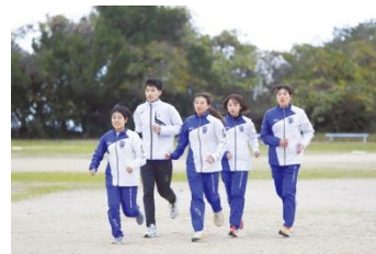
Track & Field Club