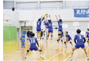
Men's Volleyball Club