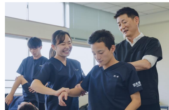
Becoming a sports and medical professional Judo Therapy Course