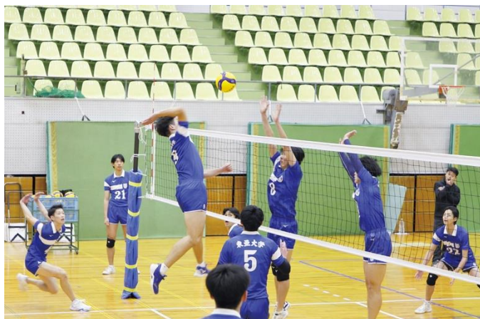
Becoming and developing athletes Athletes Training Course